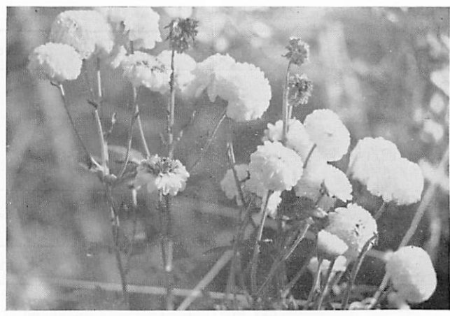
This is what the final results of Ray Blight looks like on pompon petals just at the time when some growers were ready to harvest their crops last year. A thorough program of sanitation, soil sterilization and fungicide application could have prevented or at least minimized the losses.

One successful Long Island flower grower uses two level teaspoons of Dithane Z-78 or one level tablespoon of Parzate plus one level tablespoon of 50% wettable Dieldrin per gallon of water in the first mist. Then, in the following mist sprays, he uses one-half the amount of the fungicide or one level teaspoon of Dithane Z-78 or one-half level tablespoon of Parzate plus one-half level tablespoon of the 50% Dieldrin wettable powder per gallon of water. In some cases, the insecticide or Dieldrin is eliminated, especially if thrips have not been a problem.