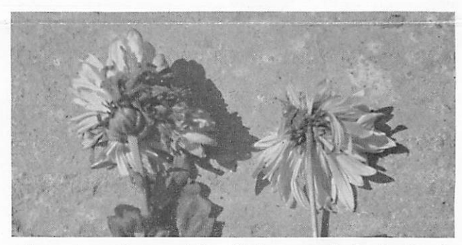
Some advanced cases of Ray Blight on standards, showing the brown petals and the brown calyx.