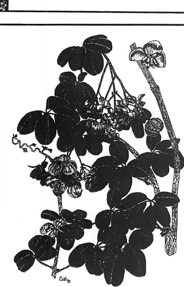
Akebia quinata - "Chocolate Vine"

Van Wingerden custom designs and manufacturers commercial greenhouse structures, including all the components and accessories to offer complete, technologically advanced, growing systems.