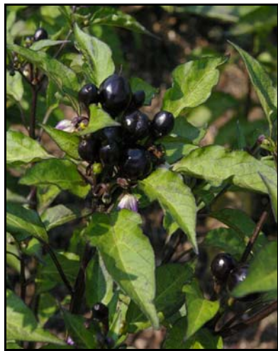
Photo 1. Fruit of ‘On the Top Round Red’ are black until late in the season when they turn red.

‘Diabolo’ (Photo 2) Stems of this plant were used for the bronze foliage. All treatments produced a vase life of 18-22 days. Minimum vase life was 12 days.