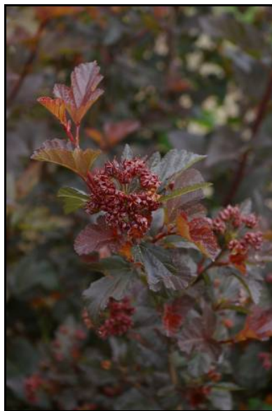
Photo 2. The bronzy foliage of ‘Diabolo’ makes a great cut with or without the fruit clusters.

Rose Kolster cultivars The large red rose hips were tested for vase life. Treatments had no effect and stems lasted 24-26 days. Minimum vase life was 16 days.