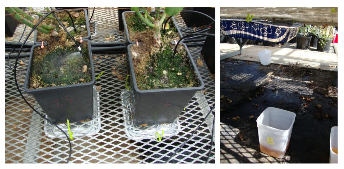
Figure 1. Aluminum trays suspended beneath pots were used to collect leachates from selected rose root half-sections (split root system) fertigated with differential nutrient solutions.

It should be noted here that it took some inspiration to figure out how to collect leachates without moving or disturbing the split root systems. In the past we used to just lift the pots and place a leach tray beneath them, but the combination of relatively large canopies, its supporting net (to hold flower stems up) and the split root system made it basically impossible to follow the same approach. Fortunately the plants were placed atop benches fitted with heavy duty, aluminum mesh surfaces, which allowed free drainage (Fig. 1) and the placement of leach trays suspended underneath the selected containers (one-half root sections). Each suspended leach tray was slanted and a drainage hole made on the lowest corner, which dripped to a 2-quart plastic container located beneath it.