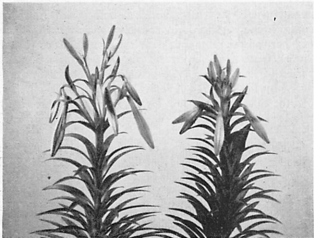
Figure 3: The appearance of (L.) Croft and (R.) Ace lilies which had not received cold storage. Bulbs were planted December 14, 1960, grown at 60N-70D, and photographed on May 8, 1961.

crease the flower number. Last spring some of our plants produced a bud count that would be desirable (Figure 3), but these plants were unacceptable because it required too long a time for them to flower, and the forcing time was too variable. We hope to find out more about this problem of flower number this year.