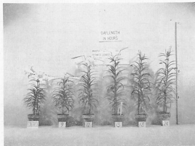
Figure 1: The effect of different photoperiods on the growth of Croft lilies. The treatments were (from L. to R.): control (natural daylength), 9-hr., 12-hr., 18-hr. and 24-hr. photoperiods. Plants were grown at a constant temperature of 65°F.

land, the effect of flashing light was compared with that of continuous light, this time using the Georgia lily. It was felt that, if successful, this would provide a more economical use of electricity, and would also remove the argument that possible temperature increases under the black cloth with continuous light were the major cause of increased flowering height. The bulbs were planted on March 31, 1961, and given the treatments listed in Table 2. They were 7- to 9-inch grade, and grown at a temperature of 60N-70D throughout. The duration and intensity of natural daylight was such at this season of the year that there was little height increase with the treated over that of the control plants. What is important to note is that black cloth was pulled over all but the control plants at 5 pm, and removed at 8 am, allowing the plants only 9 hours of natural daylight. Whereas the short-day (9 hour) plants without supplementary illumination grew only 19.2 inches tall, those with supplementary light grew 25.2 to 26.0 inches tall, and the effect of light for only 5 seconds per minute from 10 pm to 2 am produced effects equal to that for 10, 15 and 30 seconds per minute. In addition, all these periods of intermittent illumination produced height effects almost identical with the same period of continuous light. Figure 2 shows representative plants from each treatment.