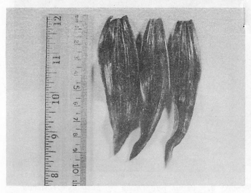
Figure 1. Leaves from an Easter lily with necrotic fleck disease.

Leaves collected in 1977 with necrotic fleck symptoms are shown in Figure 1. The most striking features of the disease are stunting, leaf twist-