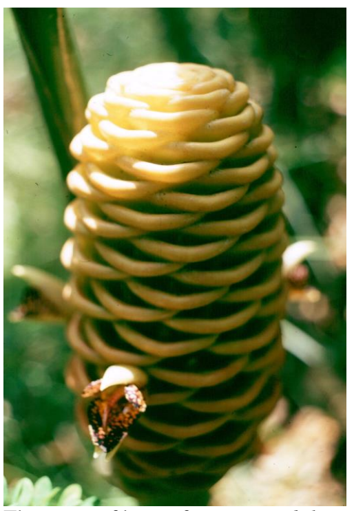
The cones of bracts for Z. spectabile can range up to 8-9 inches on established plants at the Lyon Arboretum.