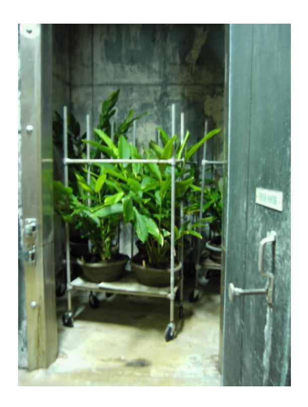
Carts used to wheel plants into darkened chamber for short days.