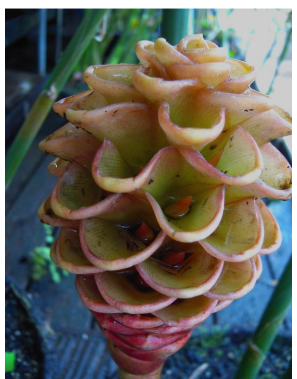
Z. spectabile inflorescence is shorter than "in the wild" at the Lyon Arboretum. Bracts redden with age.