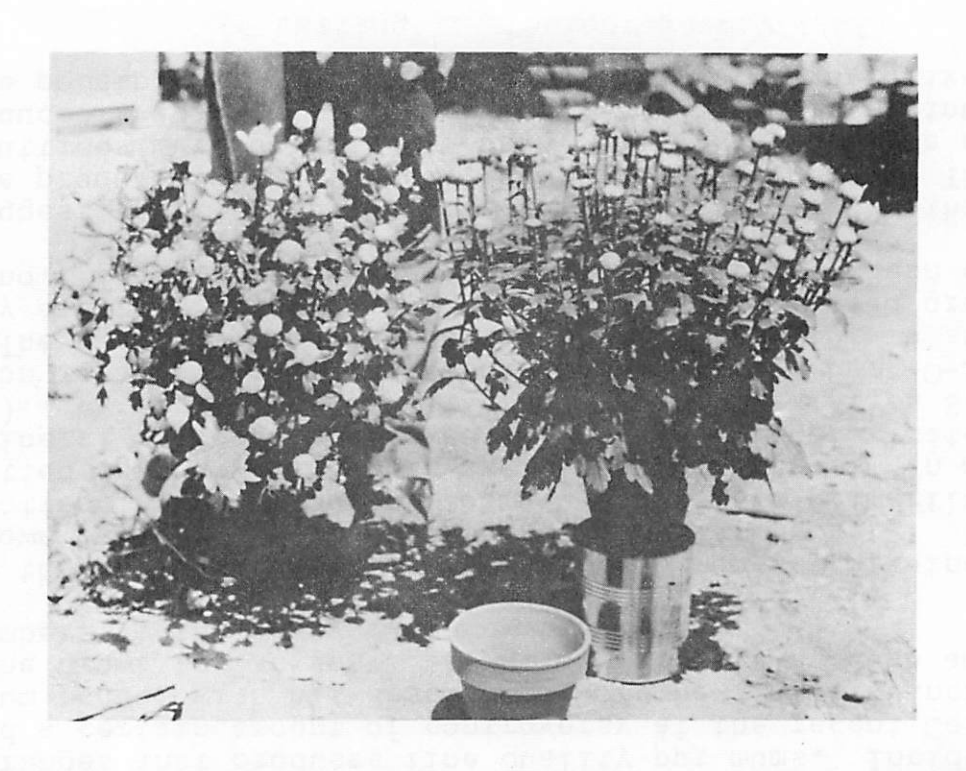
Fig. 1. Top and side view of the variety Yellow Delaware that was frame grown. Notice the uniform distribution of flowers and stems. Incidentally, these pots require no staking or tying since stem strength is excellent. Both pots had four cuttings each, pinched once. Fifty-three flowers were counted on the plant on the right. (Photographed at New River Nursery, Aug. 18, 1964.)

As outlined in the August issue of "Grower Talks", considerable interest has been stimulated in growing bigger, better and faster potted chrysanthemums. It was indeed interesting to note that the tests conducted at West Chicago and Penn State were similar to the procedures followed at New River Nursery. The major exceptions were (1) all plants at New River Nursery were grown outdoors until color showed and, (2) plants were watered only when necessary. The similar conditions provided included: automatic watering and fertilization, a well-drained medium, four cuttings per six-inch pot, and the use of growth retardants for height control.