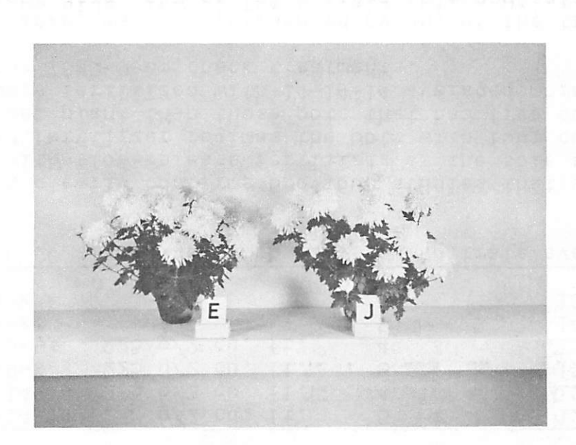
Fig. 4. Variety Yellow Delaware grown under fertilizer regimes: E=Check (5 cuttings); J=Check (4 cuttings). Photographed 9/1/64.