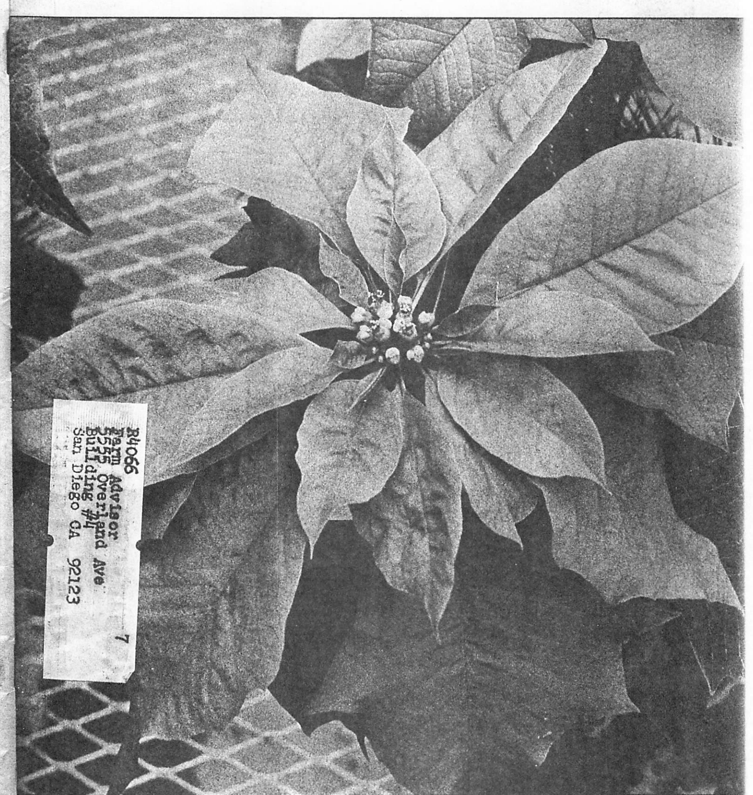
It's time to sell poinsettia displays-p13