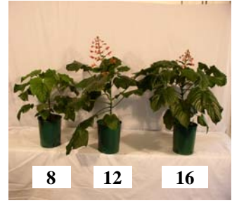
Figure 1. Effect of daily photoperiods of 8, 12, or 16 hours on growth and flowering of C. paniculata .

species was determined to be a long day plant. Plant height at 8 hour was less than those grown at 12 h and 16 h (Figure 1).