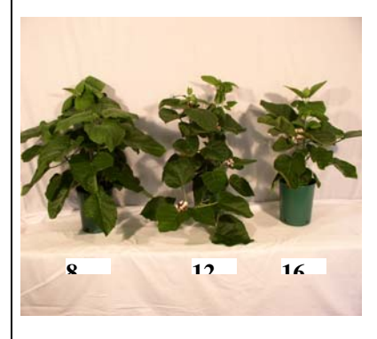
Figure 3. Effect of daily photoperiods of 8, 12, or 16 hours on growth and flowering of C . phillippinum .

After 61 d in the photoperiod treatments, C. phillippinum flowered an average of 39 d in the 12 h treatment, and an average of 17 d in the 16 h treatment. There were no flowers in the 8 h treatment. For the 8 h photoperiod, days to flower, height and number of inflorescences were different from the 12 and 16 h photoperiod. Therefore, this species was determined to be a long day plant (Figure 3).