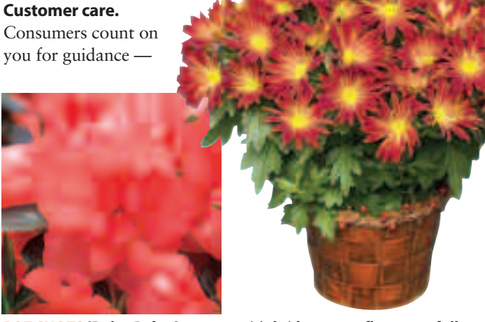
POT SHOTS 'Point Pelee' pot mum (right) has more flowers, a fuller canopy and more uniform flowering than 'Pelee,' says Yoder. 'Bittersweet' (left) is one of two new Keepsake Azalea varieties from Yoder; it features full, uniform, dark coral blooms.