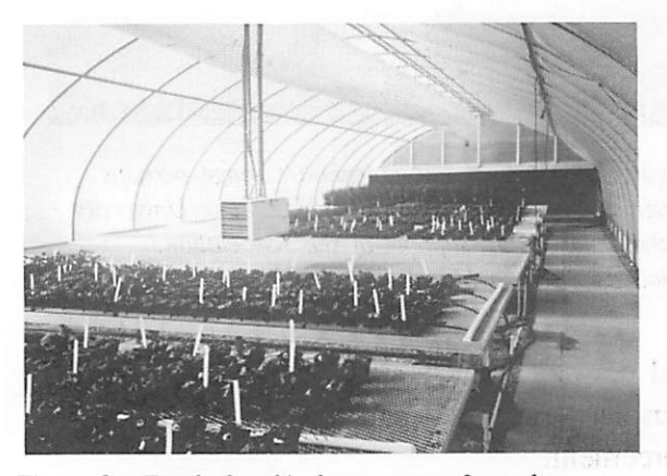
Figure 3. Funds for this house came from the Association.

house was torn down in 1987 and replaced with a double-layered polyethylene film house, new benches, and heating and cooling systems [Figure 3]. Most of the money was donated by the N.C. Commercial Flower Growers' Association).