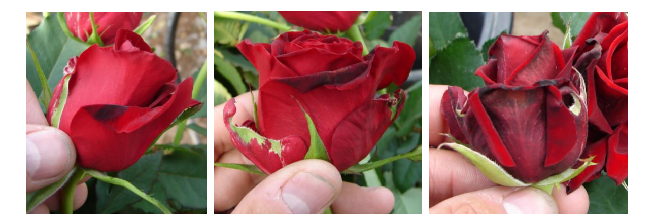
Figure 1. Petal blackening symptoms in some red rose cultivars. From left to right: 'Bull's Eye', 'Prestige' and 'Happy Hour'. Notice severity of PB symptoms on 'Happy Hour' and how mild they are on 'Bulls' Eye'.

Confirming our suspicions and previous observations, one grower pointed to the development of two distinctive PB phenomena, one readily observed during greenhouse production or preharvest (like with 'Happy Hour' and 'Freedom') and the other observed mostly in postharvest (like 'Bulls' Eye' and the old 'Royalty'), after exposure to cooling treatments followed by placement in vases under standard temperature and lighting (household) conditions. The postharvest development of PB symptoms in 'Bulls' Eye' was also associated with plant age, being more acute in younger plants (less than 3 years old) and less pronounced in older (> 3 year-old) plants.