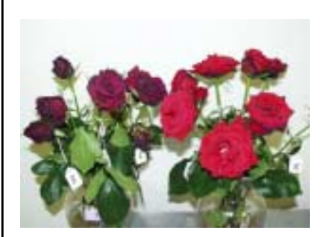
Water Flower Food

Maintaining flowers in flower food is one of the most important steps for a florist. It maximizes quality and longevity.