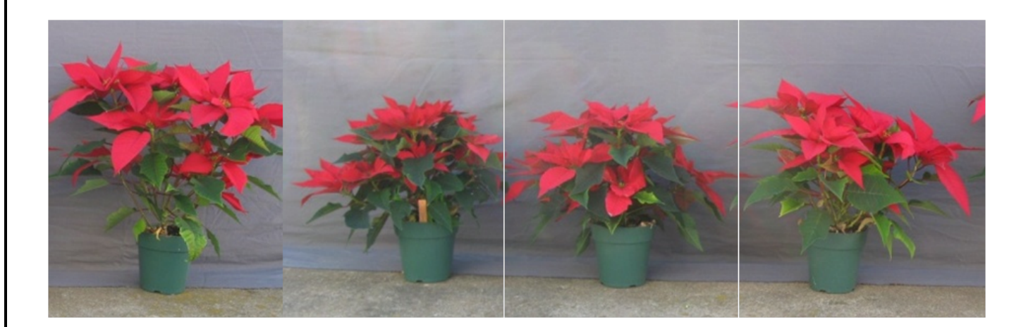
Figure 5. Representative plants poinsettias Cv. Classic Red from the various treatments. From left to right: control plants without any height control, plants drenched with PGRs, plants sprayed with PGRs, and plants exposed to controlled water deficit. Only plants exposed to controlled water deficits had a final height within the 16-18" target range.

deficit on the plants. PGR treatments reduced height more than desired. In addition, the PGR spray reduced bract size and, thus, plant quality.