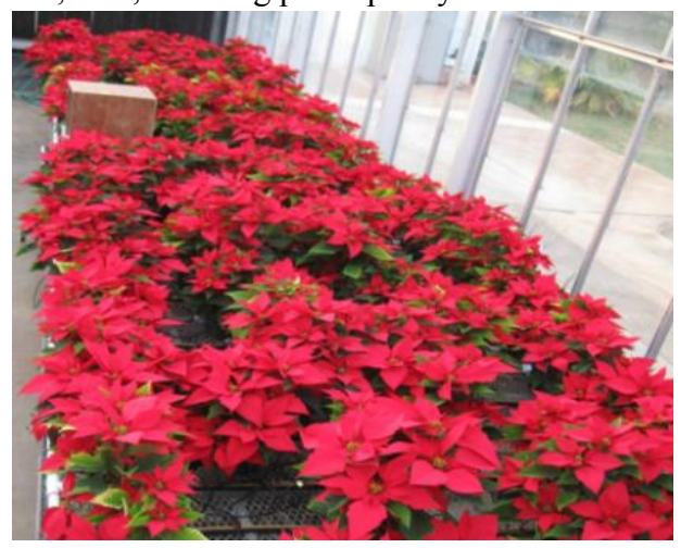
Figure 1. Overview of the study near the beginning (top) and end of the study.