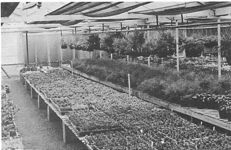
Figure 12. Bedding plants - constantly increasing and improving.

Bedding plants have come on strong in N. C., and 1982 will probably be one of the biggest years yet.