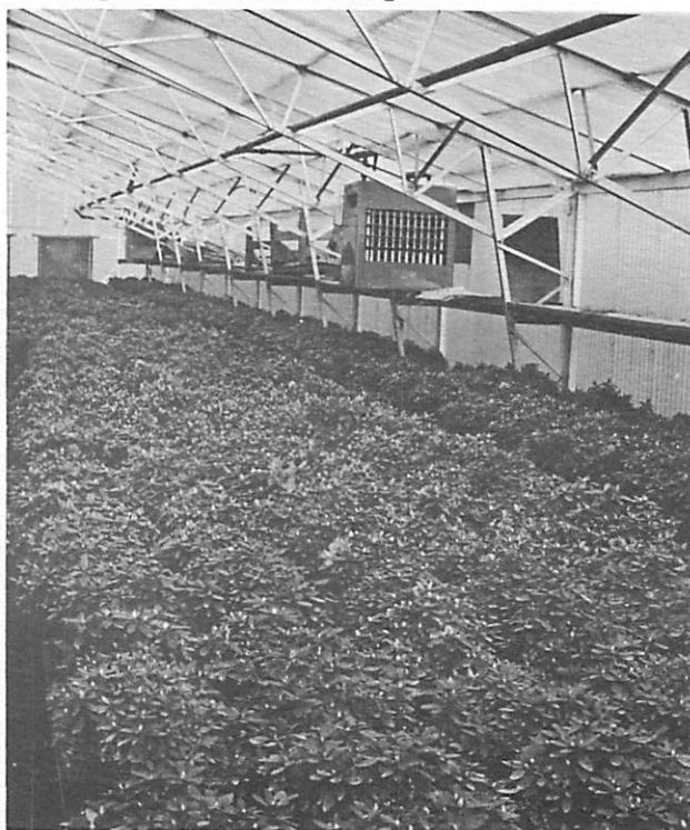
Figure 6. Azaleas - a premier pot plant excluded from statistical surveys.

Azaleas. The azalea was the premier flowering pot plant at one time and N. C. was a leading place to grow it. I have visited azalea growers in much of this country and in Belgium, the center of European azalea production, and some of the finest azaleas I have seen were forced in N. C. They might have had their start as cuttings or liners in Florida, Alabama, Virginia, South Carolina, California or Oregon but they reached their ultimate in North Carolina. The economic values of the crop in the state and nation are unknown, however, as azaleas were not included in the most recent survey. The long duration of the azalea crop, in comparison to the 3-month pot mum, generally swings the grower to pot mums. Mark-up practices of retail florists put the azalea out of reach of many customers. I wrote a rather gloomy article about the azalea's economic