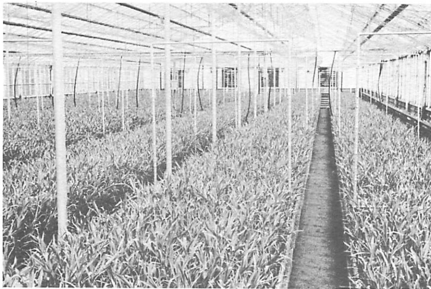
Figure 1. Carnations - their bright future of 20 years ago has been dimmed.