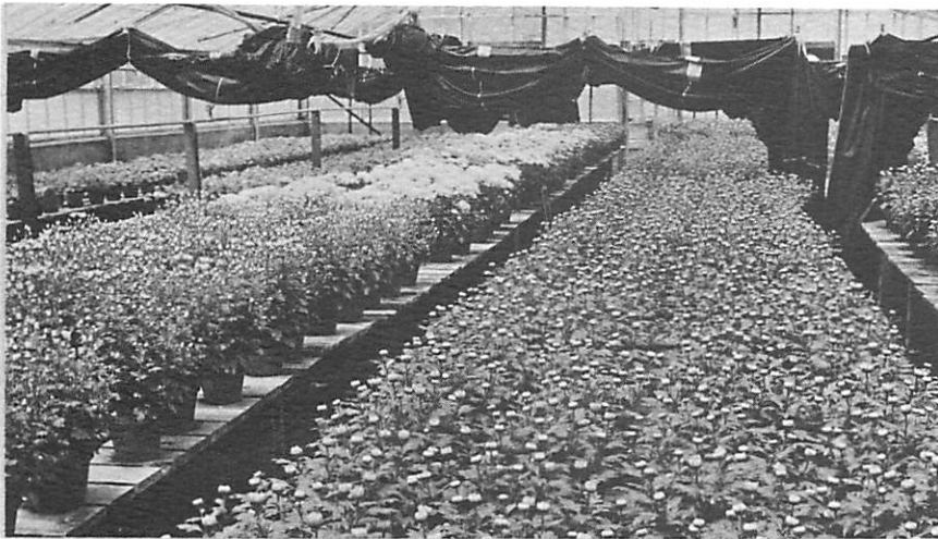
Figure 7. The #1 pot plant in North Carolina.

status and possible decline (not caused by Phytophthora) in a national trade journal and a prominent azalea supplier informed me azalea sales are better than ever on the eastern seaboard. I hope he's right, because I do believe the azalea is an excellent item in the florist industry.