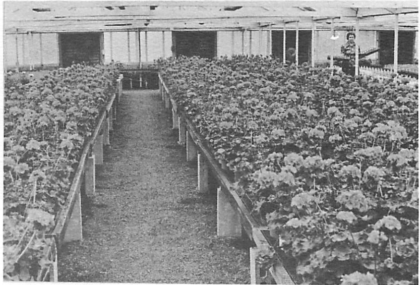
Figure 9. More growers in N. C. grow geraniums than any other pot plant.

Geraniums. When I arrived in North Carolina in 1961 I noticed the scarcity of potted geraniums in greenhouses. Jimmy Melton thought the prominence of red brick homes in the South had something to do with its low popularity, as the red geranium flowers weren't as attractive with that background as they would be against a home with white siding. Memorial Day also wasn't as big a day for selling plants as it was in the North. Whatever the reason, geraniums have steadily been gaining in