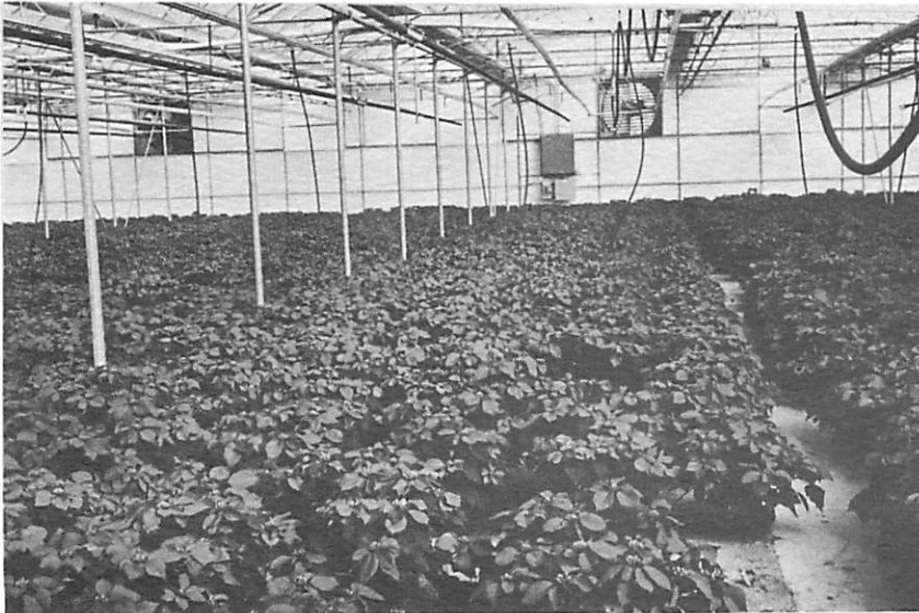
Figure 11. Poinsettia production on a grand scale. Three or 4 growers produced nearly half of the plants in 1981.

The hydrangea season seems to be getting extended, with flowering plants available and in demand well in advance of Easter. Perhaps it should be considered simply as a spring-flowering pot plant, and not gear its' production primarily to Easter and Mother's Day.