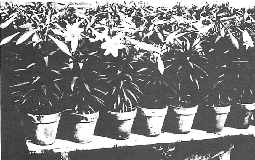
Figure 8, Easter lilies - highest wholesale value per square foot in 1981.

Other potted crops, with the exception of the poinsettia, have suffered perhaps as the pot mum gained so much. The long-lasting quality of the pot mum, with the wide assortment of flower colors and forms, make it a favorite with the florist and their customers.