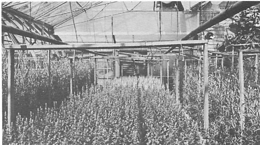
Figure 5. A bed of snapdragons flanked by carnations.

Snapdragons. This is a crop Joe Love and I have suggested to growers who wish to continue in cut flower production but our suggestions usually are met with apathy or completely ignored. Some growers have tried snapdragons once, had difficulty and never grew them again. There is plenty of cultural information available, and a good assortment of varieties to fit the