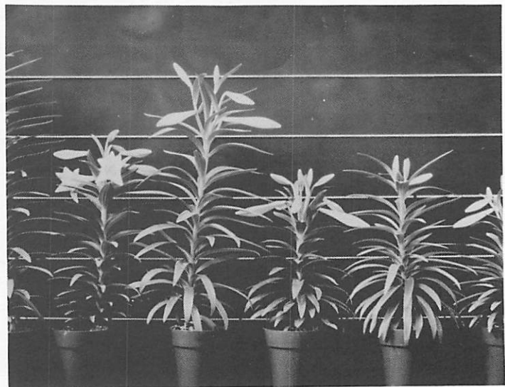
Figure 2. (L-R) Plants grown under 70% shade, full sun, 70% shade + 1 spray 10 ppm Sumagic, full sun + 1 spray 10 ppm Sumagic, 70% shade + 2 sprays 10 ppm Sumagic, and full sun + 2 sprays 10 ppm Sumagic.

When used as a spray, both should be applied at 1/2 gallon per 100 ft 2 of bench area. If you apply more or less volume without adjusting the concentration, you may be unhappy with the resulting height (Figure 1). Remember that the dosage of chemical received per pot is the product of the solution concentration times the volume applied per pot. Both are important in predicting chemical activity! The recommended range of A-Rest sprays is 33-66 ppm; the