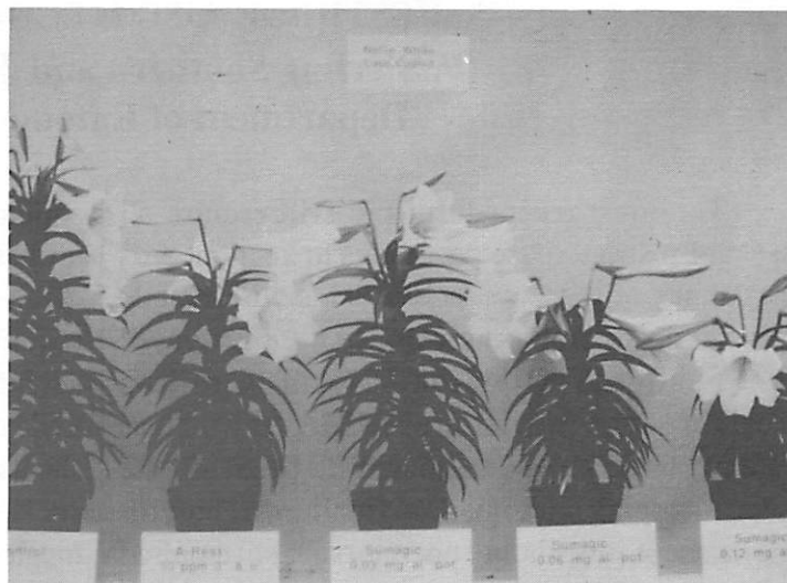
Figure 3. (L-R) Control; sprayed with 50 ppm A-Rest twice; or drenched with 0.03, 0.06, or 0.12 mg Sumagic.

As with any cultural change such as trying a new substrate or a new pesticide, test Sumagic on only a small portion of your crop. However, treat enough plants to have confidence in your results. Also remember that spacing, lighting, and temperature can affect stretching. For a true test, use a representative bench in your greenhouse, not the back corner.