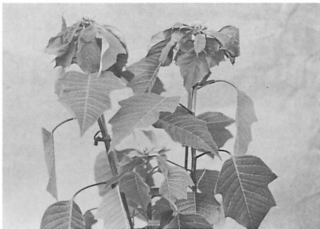
FIGURE 1. Poinsettia plant showing "wilted" or "curled" bracts.