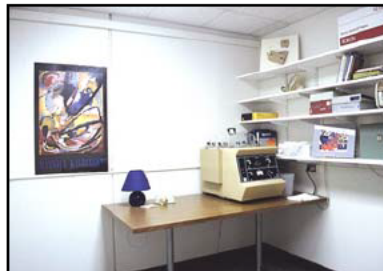
Non-plant objects treatment