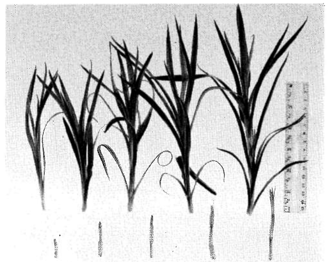
Figure 1--From left to right, cuttings taken from stock plants at 4, 5, 6, 7, and 8 pairs of expanded leaves. Note increasing length of stems and increased growth of axillary shoots as size increases (stripped cuttings below).

Different sized cuttings were selected from White Pikes Peak stock plants. Each cutting was removed at a position allowing 3 pairs of leaves to remain on the stock plant shoot. The cuttings were