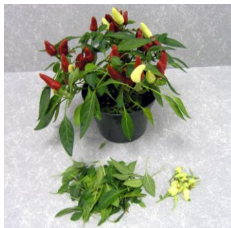
Photo 4. Exposure to ethylene for 48 hours induced flower, leaf and fruit drop on Ornamental Pepper.

With exposure times of 48 and 72 hours, flower, leaf and fruit drop occurred. The longer the exposure time the more extensive the damage.