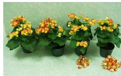
Photo 1. Elatior Begonia 'Carnival' treated with EthylBloc® and then exposed to 1 ppm ethylene for 24 hrs. Duration (from left to right) 4, 7, 10 and 13 days later.

EthylBloc® was very effective in protecting plants from ethylene. When exposed to 1 ppm ethylene for 24 hours after treatment, the protection lasted from 7-10 days. When plants were exposed to continuous 1 ppm ethylene, EthylBloc® was effective for 4 days.