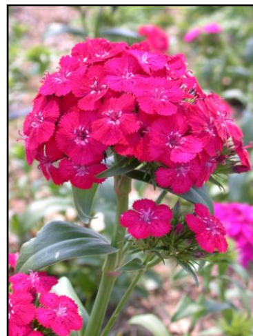
Photo 1. Dianthus 'Amazon Neon'.

holding solution was used. Hydrating solution had no effect.