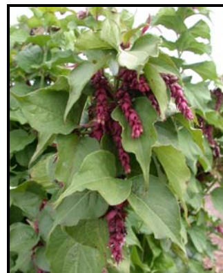
Photo 1. Leycesteria inflorescences are more visible when most of the foliage is removed.

Vase life was 11-13 days regardless of treatment. Significant spider mite damage made it unclear whether vase life decline was due to the spider mites or natural decline. Minimum vase life was 9 days.