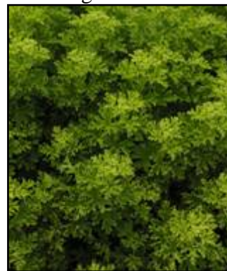
Photo 2. Geranium 'Citrus Spice' can be used for fragrant cut foliage.

(Photo 2) Vase life was 17-23 days and unaffected by hydrating and holding solutions. Minimum vase life was 8 days.