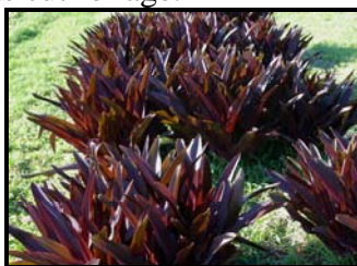
Photo 1. Eucomis 'Sparkling Burgundy' leaves can be used as cut foliage.

Burgundy ' leaves (Photo 1) All treatments had a vase life of at least 35 days. The study was terminated at that time.