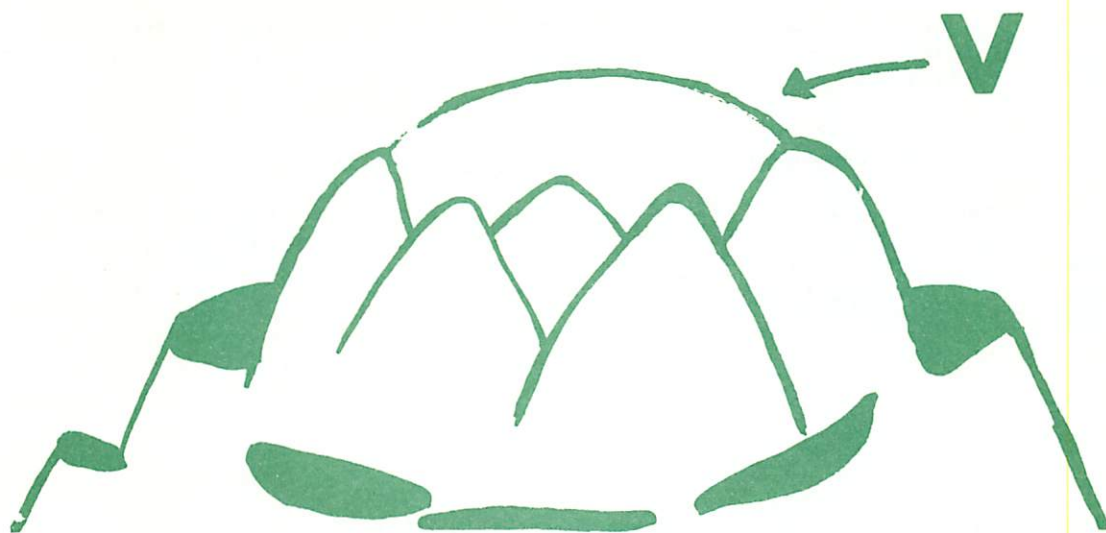
Figure 2. The growing point of an Easter lily in the vegetative (V) stage of growth. Note the older leaves have been trimmed away and the very young leaves are claspings the vegetative growing point.