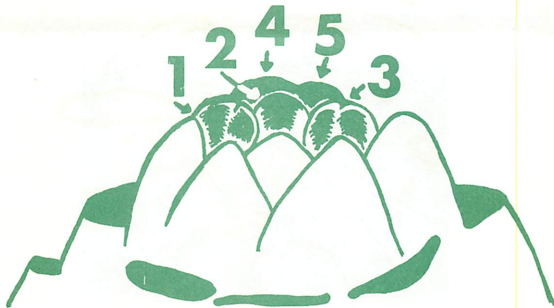
Figure 3. A reproductive growing point showing five primary flower buds (P). When temperatures are dipped, the central growing point will elongate through them and form a floral stalk (pedicel) supporting secondary flower buds (figure 1). Tertiary buds will form in the axils of bract leaves on the stems (peduncles) supporting the primary and secondary flowers.