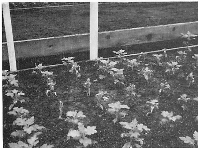
Fig 1. Typical injury to chrysanthemum cuttings planted in Captan treated soil. Photographed August 20, 1960.

The first week of August 1960 the old crop was removed and the soil prepared for a new crop of chrysanthemums. Superphosphate was added as needed and the soil steam sterilized. It was immediately after planting that the injury occurred. The unusual chemical smell of the soil following steaming was the first indication that things were not right. The Captan was suspect because two benches in the greenhouse that had received the Captan treatment as previously described had the soil removed and these benches showed no damage of any kind.