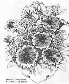
Petunia, Grandiflora, RED PICOTEE hybrid

Grooming of the plants (removing dead flowers, dead or dying leaves, etc.) is essential if ethylene gas is not to be produced in excessive amounts as well as adding to the overall cleanliness of the area. Sales areas should and