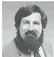
Lloyd Traven Ball Seed Company West Chicago, IL

All over the country growers have been convinced of the many advantages of the plug system. Most growers still prefer to buy plugs from specialist propagators, but we see a rapid increase in the number of operations producing their own plug seedlings. There are several reasons, both pro and con, for each production style.