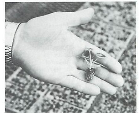
A well formed geranium seedling grown from a Ball Spark-Plug. Note the highly-developed zonation on the foliage. The seedling was grown in flats similar to those shown in the background.

It must be mentioned that, given a higher germination percentage and rate, it may be cheaper to grow your own plug seedlings. This is true in many cases, but certainly not all. If a grower is germinating 80% or less, there is a definite question whether this would be an economic undertaking. The alternatives are either to purchase from a specialist propagator or to double-sow. Double-sowing is not recommended for expensive seeds like impatiens or geraniums.