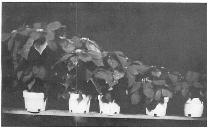
Fig. 2. Effect of granular ancymidol incorporated in medium at 0, 0.25, 0.50, 1.0, and 2.0 mg ai/15 cm pot (from left to right) of poinsettia cv. 'Annette Hegg Supreme.'

a Mean separation, within columns, by Duncan's multiple range test, 5% level.