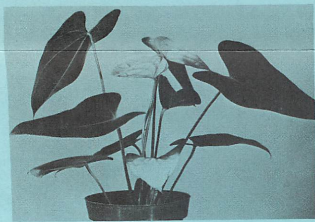
Figure 1. Hidden Treasure—No Spadix.