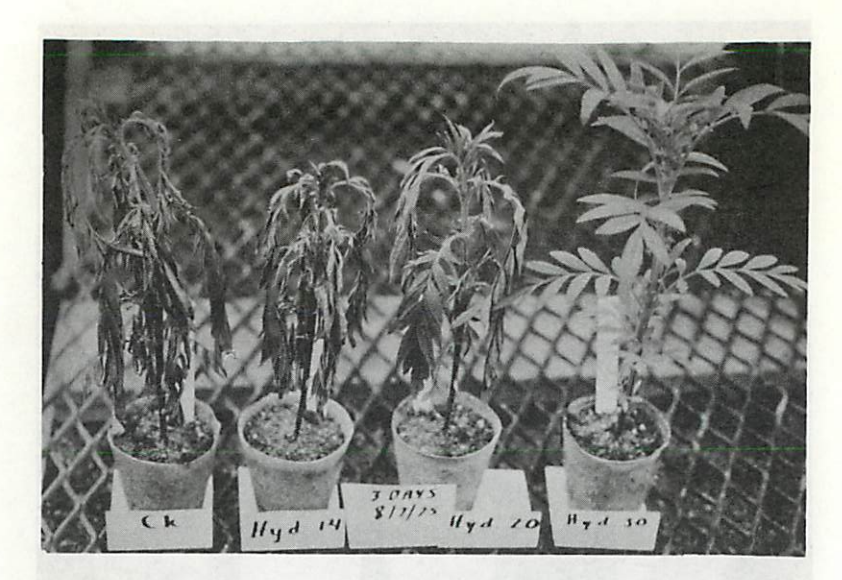
Figure 2. African marigolds grown in the same treatments as in Figure 1. Wilting was severe in 3 days except at the 30 lb. rate.

At 20 lbs. hydrogel, resistance to wilting was little better than at the 14 lbs. rate, just noticeably better than 1:1:1.