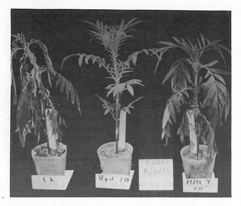
Figure 3. African marigolds grown in 1:1:1 soil mix with 20 lbs. of VITERRA<sup>R</sup> Hydrogel or AM-9. Although AM-9 is as effective in reducing wilting, its higher cost would seem to preclude its use.

This may be compared to a cost of $31.20 per cubic yard of mix for calcined clay (LuSoil at $4.95/50 lb. bag) less the cost of the sand displaced (say $2.00 or less) giving a cost of 6.0¢ per 6" azalea pot.