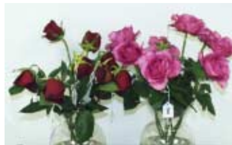
Photo 2. 'Poison' (right) performed better in water than 'Madame DelBard' (left).

On the average, a 25-30% reduction in vase life and flower opening occurred when flowers were maintained in water. This demonstrates the importance of using flower food for cut flower arrangements and in supplying consumers with flower food packets when flowers are purchased.