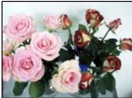
Photo 1 'Light Orlando' (left) opened fully compared to 'Leonidas' (right).

In contrast, 'Light Orlando', 'Reward', 'Poison', 'Eliza' and 'First Red' opened readily. The flowers opened fully and the petals fully expanded.