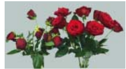
Water Flower food