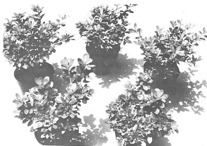
Fig. 2. Influence of varying length of spray time on effectiveness of growth retardant on 'Constance' azalea. Treatment times per plant were, left to right: top row — 1 second, 0.5 second, and 0 second (control); bottom row — 2 seconds and 4 seconds.