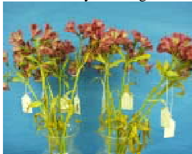
Control (pulsed in water)