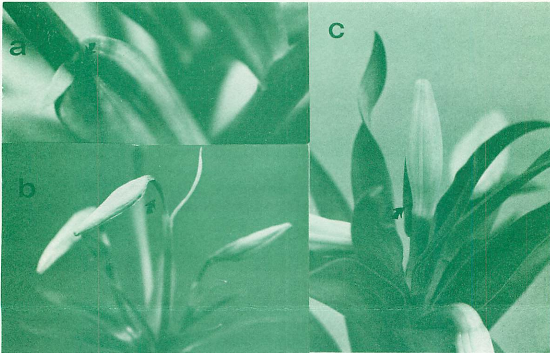
Fig. 2. Aborted buds ( \leq 0.4 in) shown at the axils of bracts (a) and aborted buds ( > 0.4 in) at 2 stages of development (b,c) as indicated.