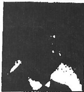
TODD R. SCHWINDT