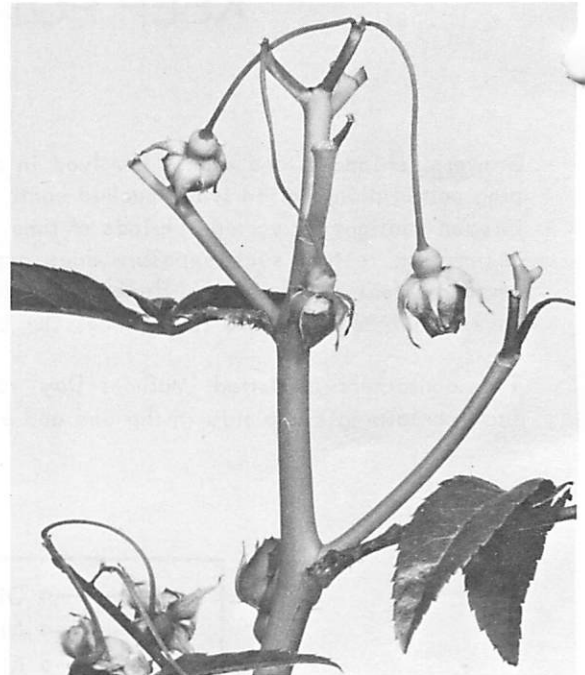
Figure 2. Nature of bud abscission of 'Mothers Day' roses subjected to high temperatures in the field.

No heating tests were run with packages of the 'Margo Koster' variety. However, this cultivar and the 'Mothers Day' were observed in the field. It was evident that exposure of 'Margo Koster' plants to high temperatures for several days in a row had relatively little adverse effect on bud opening and development. Plant growth was satisfactory in 'Mothers Day' roses, but after several hot days, buds failed to open properly and/or abscised at the base of the pedicel. Flowering shoots soon became devoid of buds.