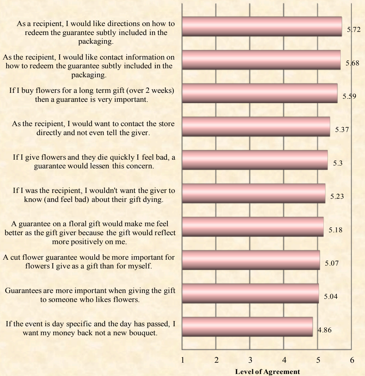
Figure 1. Participants' opinions about guarantees on cut flower gifts (1=strongly disagree, 7=strongly agree)