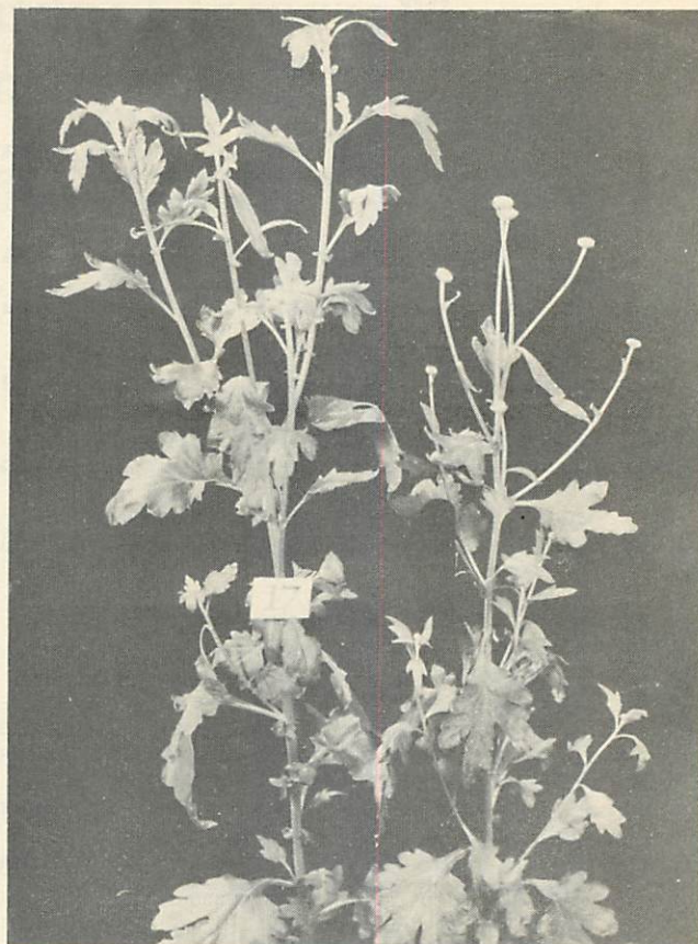
Figure 4. One hour of light from 11:30 p.m. to 12:30 a.m. Left - normal; right - stunted.

None of these buds developed to flowering under these conditions. Apparently stunted plants formed a terminal cluster and developed the buds somewhat slower than those plants given no additional light supplementing day light. These buds opened.