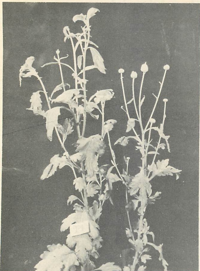
Figure 3. Thirty minutes of light at 9 p.m. and at 2 a.m. Left - normal; right - stunted.