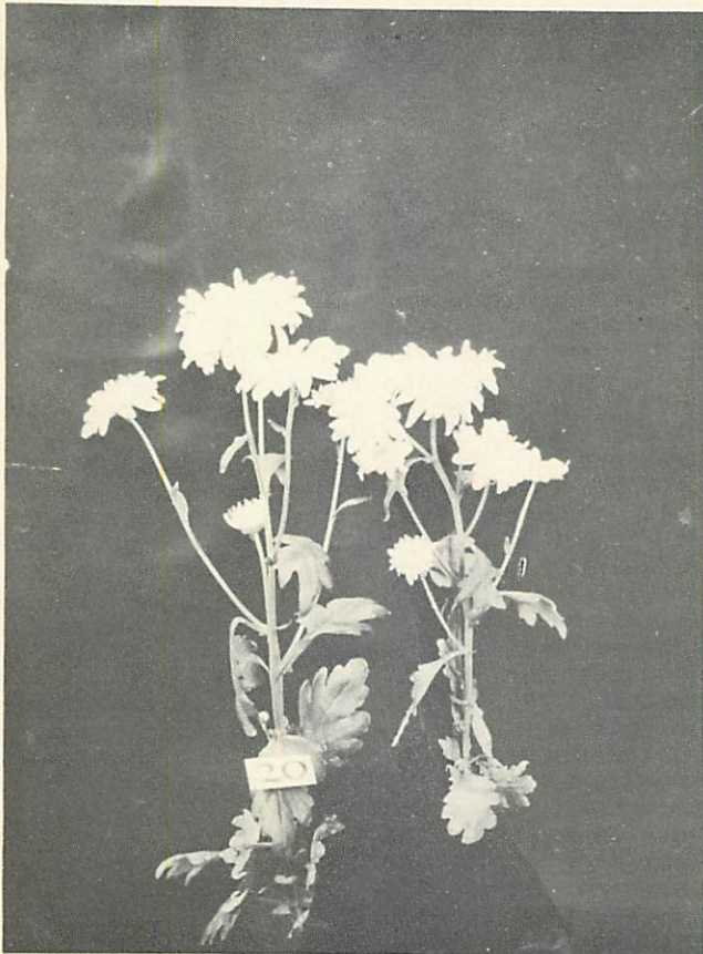
Figure 1. No additional light. Left - normal; right - stunt.

A series of experiments to determine the minimum possible artificial light to prevent flower bud formation during the winter showed these great differences in flowering response of apparently stunted and apparently normal plants. Rooted cuttings of five varieties had been given sufficient light to prevent budding. They were planted September 15. Some were given normal daylength which permitted budding and flowering immediately. Some plants showed characteristics of stunt and other plants appeared normal. (Figure 1) Nevada showed a high percentage of plants stunted, yet the budding and flowering time was not much different on all plants even though some were smaller and showed other characteristics of stunt. When plants of Nevada were given 30 minutes of artificial light each night - 15 minutes at 9 p.m. and 15 minutes at 2 a.m., normal plants formed crown buds, followed by crown buds. (Figure 2)