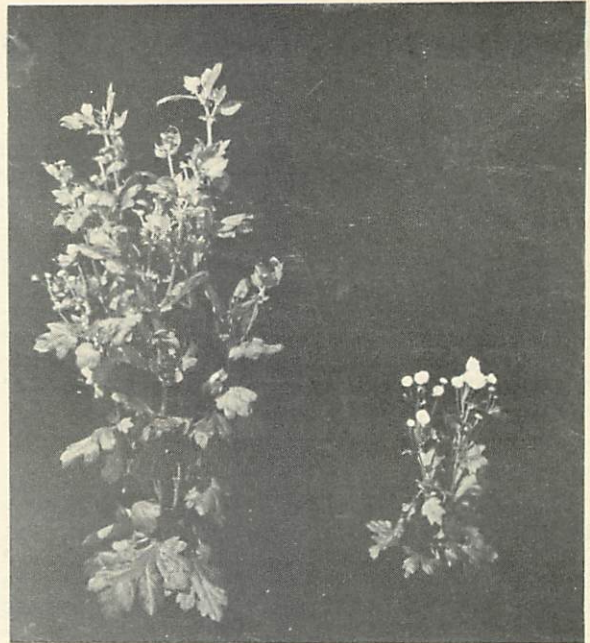
Arcadia given two hours of artificial light (7 to 9 p.m.) December and January. Apparently normal plants (left) bud continuously but the buds fail to develop while apparently stunted plants (right) bud and flower.