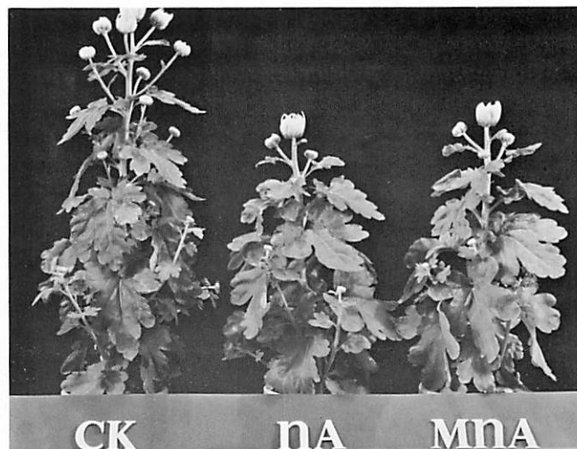
FIGURE 3 (left to right): Control plant, plant treated with naphthalene vapors (Na) and plant treated with 1-methylnaphthalene vapors (MNA). Plants were exposed to vapors for a period of 15 hours after the 23rd short day. Note the retardation of the growth of the two treated plants. No injury to the terminal flowers was observed.

One can readily see that these "naphthalenes" used as vapors show promise and might have commercial application by placing the materials under the black cloth at a time when the chrysanthemums are in the correct stage