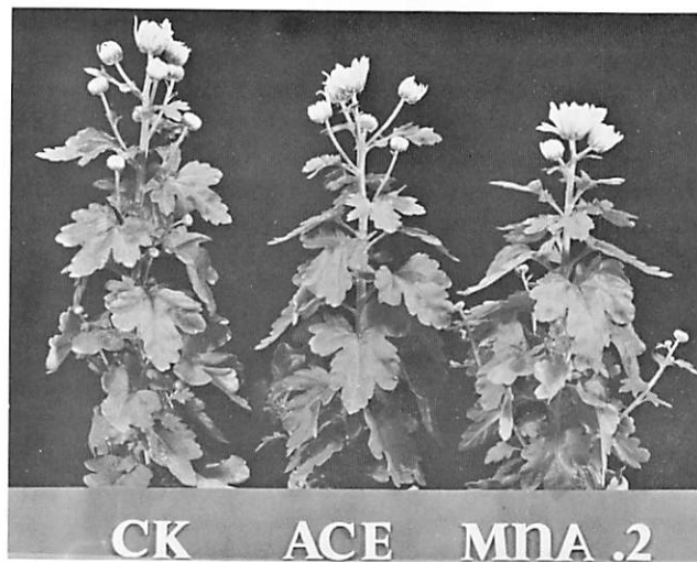
FIGURE 2 (left to right): Control plant sprayed with 4:6 acetone-water mixture, plants sprayed with a "100% acenaphthene stock solution," and plants sprayed with a 0.25% 1-methylnaphthalene emulsion. The number should read ".25" rather than ".2" as shown.

two lower concentrations which more nearly approach the correct range for treatment. Figure 2 illustrates a typical plant treated with 0.25% 1-methylnaphthalene. None of the terminal flowers were damaged, and disbudding was complete to be within a few flowers of the top (Figure 2). This material is very promising at least for Princess Anne. Experiments are now being conducted on Fred Shoemith as well; however, much lower concentrations are being used because of extreme sensitivity of this cultivar.