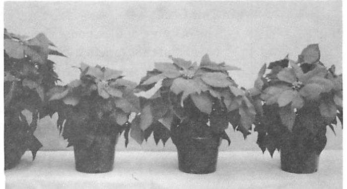
"Lilo" plants in a growth-regulator experiment, and grown in 5" pots.