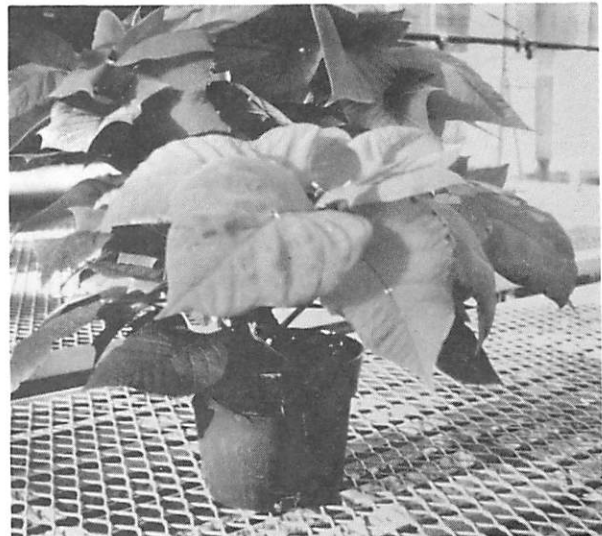
"Sup Ji Bi"