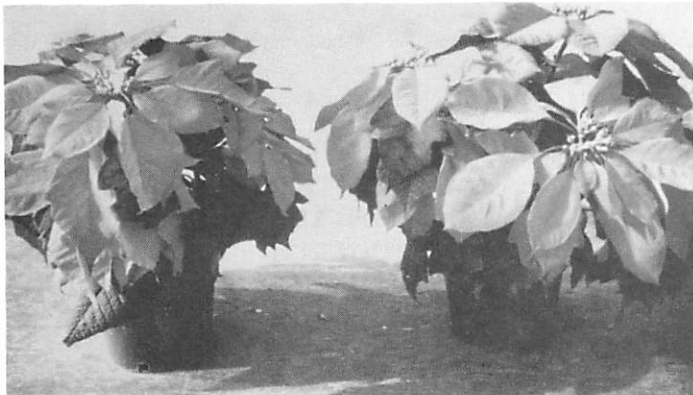
"Lilo", left, and "Annette Hegg Dark Red", right, after 48 hours in paper sleeves.