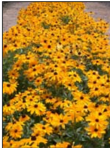
Photo 1. Rudbeckia 'Indian Summer'

Stems were harvested when the outer petals were fully open. Flowers were monitored daily to determine the end of consumer vase life. The end of consumer vase life occurred when the stem collapsed or the petals began to turn brown.