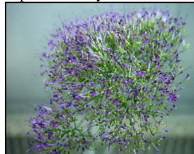
Photo 2. Cut trachelium 'Jemmy Royal Purple' flowers did not continue to open when exposed to ethylene.

Trachelium was sensitive to ethylene at 0.1 or 1.0 ppm. The florets either closed entirely or did not continue to open (Photo 2). The application of 1-MCP or STS prevented the open florets from closing and promoted opening of new florets.