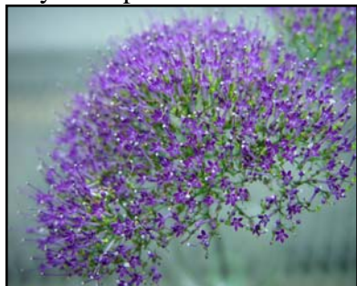
Photo 1. Trachelium 'Jemmy Royal Purple'.

used as fillers in bouquets or arrangements, blending softly with most colors. This study determined the optimum handling procedures to extend the postharvest life of cut trachelium stems.