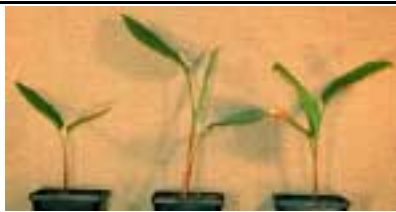
2 mo. 3 mo. 4 mo. All stored at 59°F

Storage temperature had no significant effect on days to emergence. An increase in storage temperature decreased rhizome sucrose content and increased glucose and fructose. This again reflected the mobilization of sugars for emergence. The rhizome storage treatments had no significant effect on flowering and final shoot dry weight.