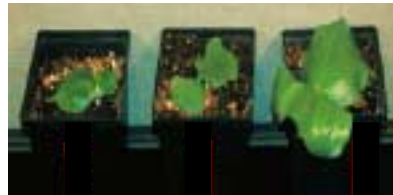
59°F 68°F 77°F All stored for 3 months

Emergence was hastened for rhizomes stored at 77°F.