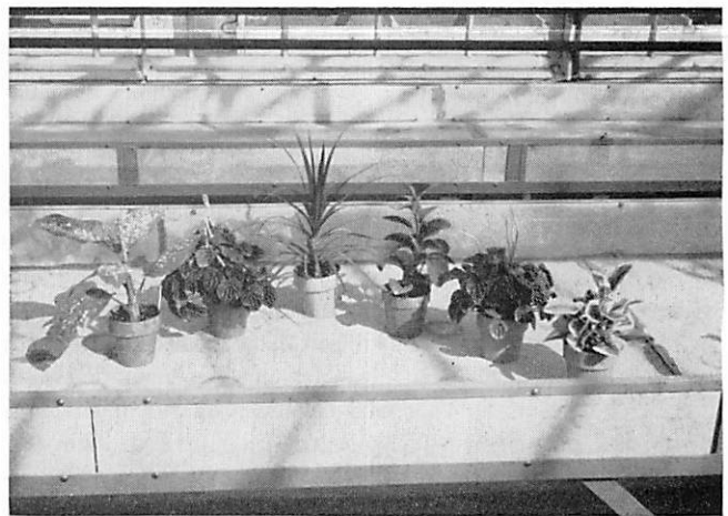
Figure 4: A series of foliage plants potted October 18 to Mix A left: Diffenbachia picta , Peperomia , Emerald Ripple and Dra-cena Marginata ; Mix B right, Peromia , Emerald Ripple and Variegata .