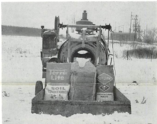
Figure 1: The ingredients for peat-lite mixes are available at any time. They can be mixed easily with large equipment for bulk handling.

The ingredients for "peat-lite" mixes are readily avail-