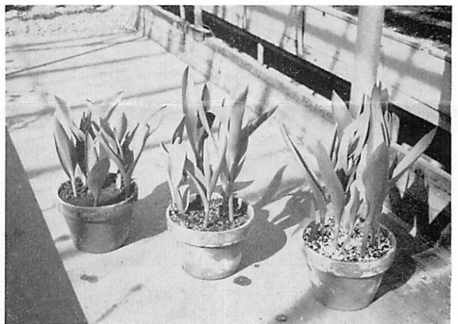
Figure 5: Tulips in soil left, Mix A and Mix B right. Potted November 13 and placed in 50° refrigeration. Placed in 50° greenhouse February 28. Photo March 16. Notice greater height of tulips in mixes.