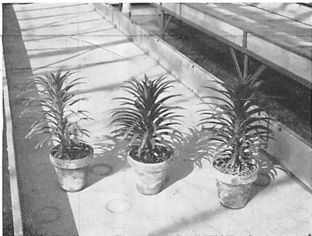
Figure 6: Ace lilies potted in 5-inch pots January 3, 1963 in left, soil; center Mix A; right Mix B. Photographed 3-16-63.

Foliage plants —These plants have long been grown in more types of artificial media than any other florist crop. Both mixes have been successfully used (Fig. 4). Under prolonged, cloudy weather conditions, Mix A may have the tendency to stay too wet. Watch the watering under these conditions.