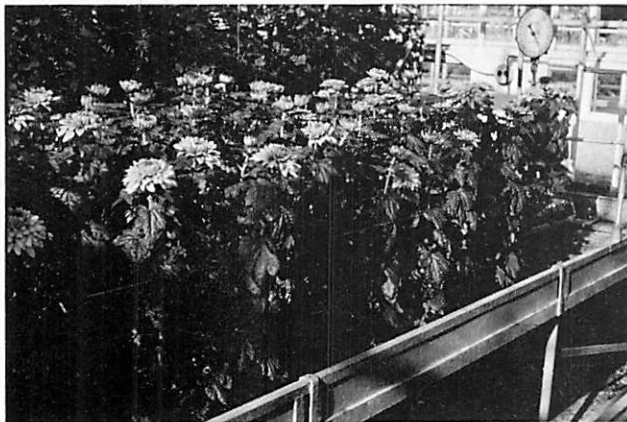
FIGURE 1—Flowering bed of Princess Anne in "Pillow-Pak."

Rooted cuttings of Princess Anne Mums were planted September 10, 1965 in 4-inch diameter black polyethylene and 6-inch clear polyethylene tubes. Five cuttings were planted in a 30-inch long tube that contained no drain holes. After planting, the cuttings were watered with a predetermined amount of water that thoroughly wetted the media but did not saturate it. Approximately 3 pints of water was used to wet 6\frac{1}{2} quarts of peat-lite mix. Subsequent waterings were made on the basis of weight loss. When the pillow pak lost 1\frac{1}{2} pounds, a pint and one-half of water was added.