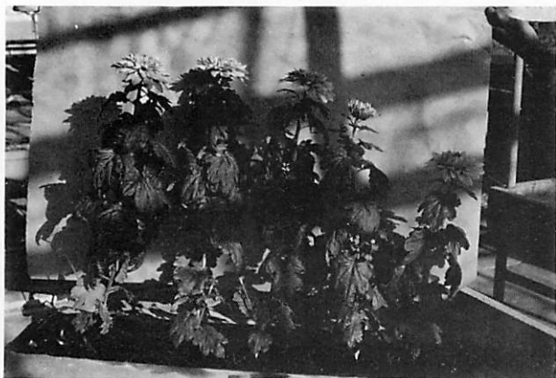
FIGURE 3—One 4-inch diameter pillow pak of Princess Anne

Other crops such as bedding plants or geraniums may also be grown in the "pillow pak." Bedding plants in such containers would be versatile as shown in the figure. Special occasions might call for hanging containers of petunias or other crops. Patios, porches, halls, etc. could easily be decorated with growing plants.