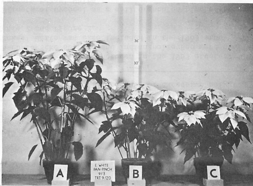
Figure 2. Eckes' White, propagated August 1, potted and pinched September 3, and treated with Cycocel September 20. A=check; B=2 qts., Cycocel/15 gallons water; C=2 qts. Cycocel/10 gallons water. Photo taken December 20, 1963.

We had satisfactory results with these high rates of Cycocel on Eckes' White plants, propagated August 1 and 15. Rosenau, at the Waltham Field Station in Massachusetts, has advised growers to use Cycocel on Eckes' White at one-fourth to one-half of the rate recommended for the red varieties, to avoid bract deformities. We noted no bract deformities on Eckes' White plants treated with twice the rate recommended for Barbara Ecke Supreme and Indianapolis Red. Bract size was reduced, but the plants were of good quality and considered salable.