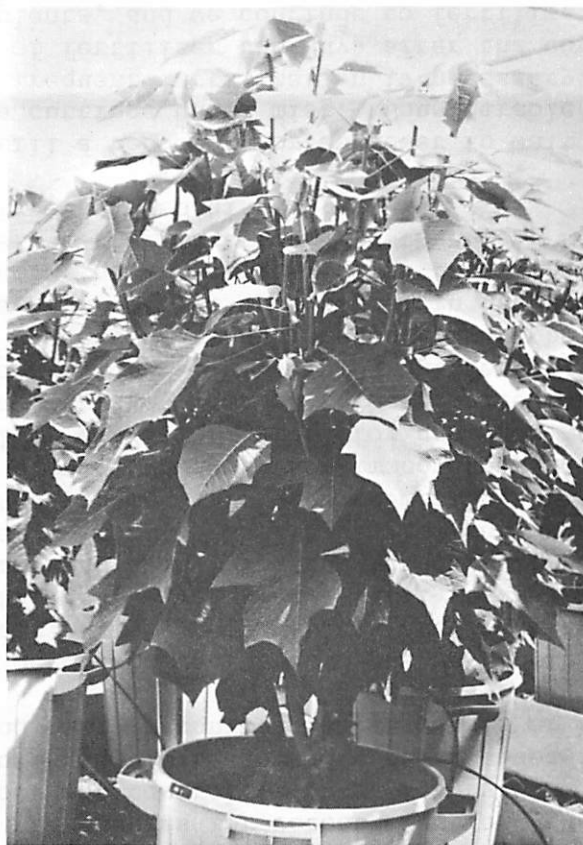
Figure 1. Poinsettia stock plant, variety Paul Mikkelsen. Photographed July 22, 1964.

We are using the new Chapin watering system for large containers, with satisfactory results.