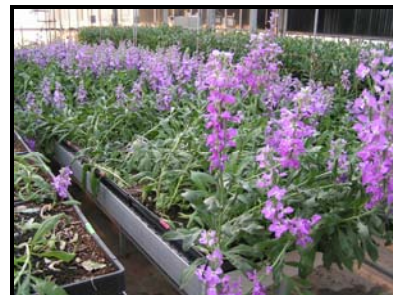
Photo 3. Stock 'Vivas Blue' plants during production. Note that the use of support netting would prevent bending of the stems.

For Additional Information Contact: john_dole@ncsu.edu