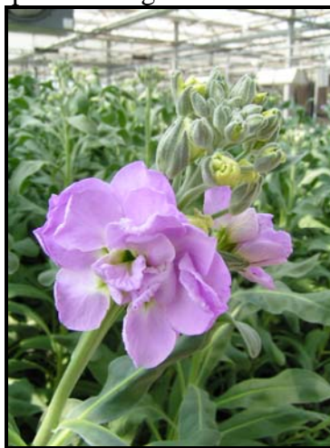
Photo 2. Stock 'Vivas Blue' at optimum stage for harvest.

Flowers were monitored daily to determine the end of the consumer vase life, when the "average consumer" would dispose of the flower. This was based on floret wilt and death; petal shatter and bluing; and stem softening, wilt, and collapse.