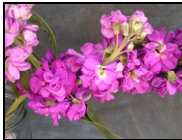
Photo 1. Stock 'Vivas Blue'.

New cultivars and species of cut flowers are constantly required by the floricultural industry to maintain and increase customer interest. However, growers, wholesalers, and retailers are reluctant to handle new products due to the lack of postharvest information. The 'Vivas Blue' stock flower (Photo 1) is a new cultivar of the popular species that does not need a cold treatment for flower initiation. This study determined the optimum postharvest handling procedures for cut 'Vivas Blue' stock flowers.