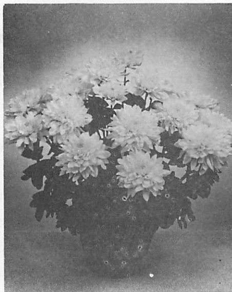
Figure 1. Cream Yellow Princess Anne, planted Nov. 11, lighted Nov. 11 to Nov. 18, pinched Nov. 24, treated with 125 ppm Phosfon-D solution (as described in text) on Nov. 27. Photo made on February 5.