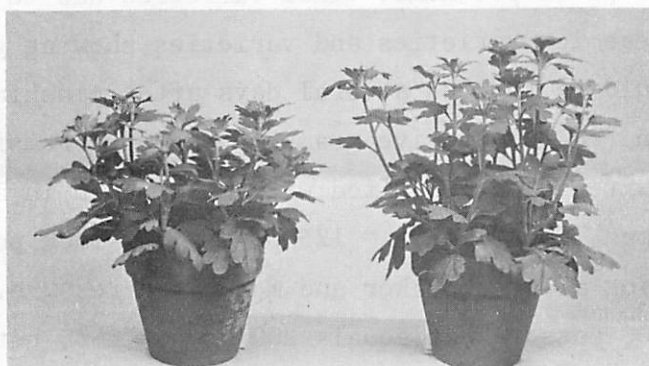
Figure 2. Golden Yellow Princess Anne, planted Dec. 22, lighted Dec. 22 to Dec. 29, pinched Jan. 5, plant on left was treated with 125 ppm Phosfon-D solution (as described in text) on Jan. 8. Photo made on February 5.