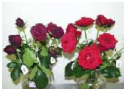
Water Flower Food

Maintaining flowers in flower food is one of the most important steps for a florist. It maximizes quality and longevity.