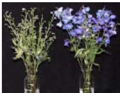
Ethylene No ethylene

Ethylene causes premature flower death in delphiniums and other sensitive species.